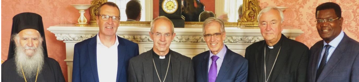
The 6 Presidents of Churches Together in England

CTE Presidents' statement and accompanying video transcript Sept 2016